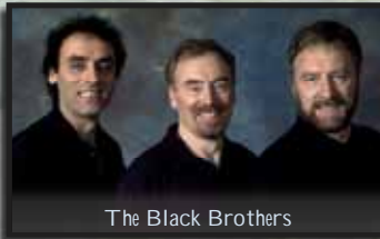
The Black Brothers