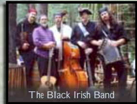
The Black Irish Band